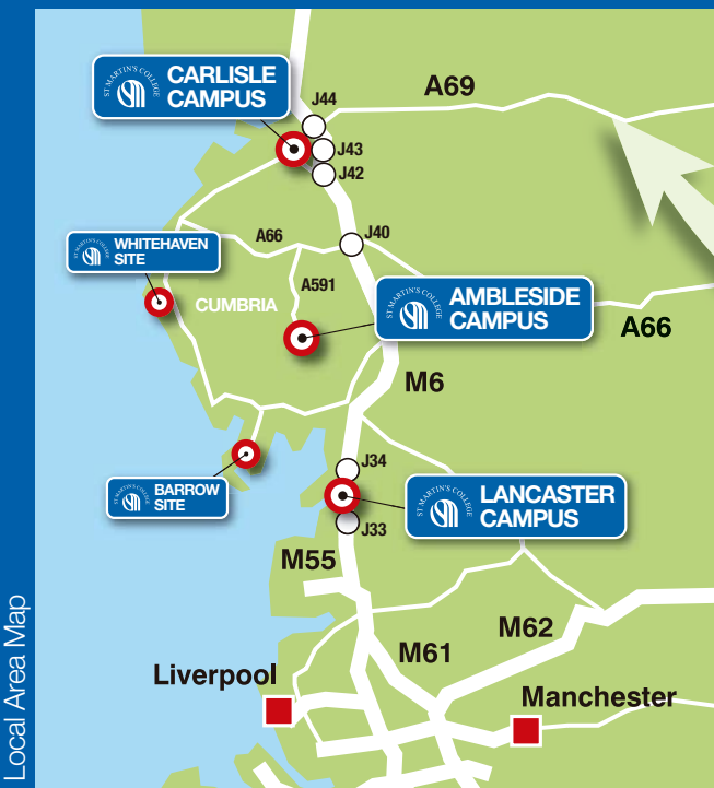
Local Area Map

Visitors should use the Pay and Display parking. For those visiting by invitation parking may be booked in advance.